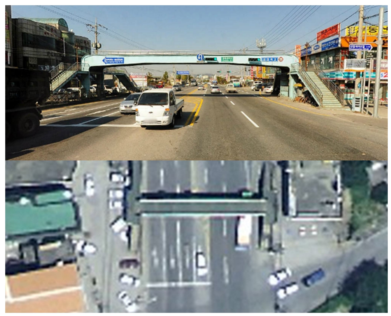
Figure 1 Study area satellite photo (Note: the satellite photo in this area has a low resolution)

The case study area was selected in which the pedestrian over pass that makes pedestrians uncomfortable can be replaced with a pedestrian crossing.