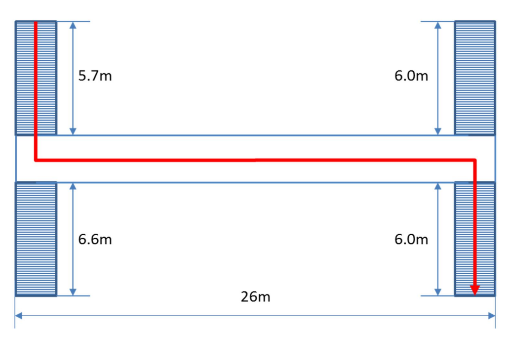
Figure 3 A sketch of pedestrian over pass

The total travel time is crossing time plus stair time.