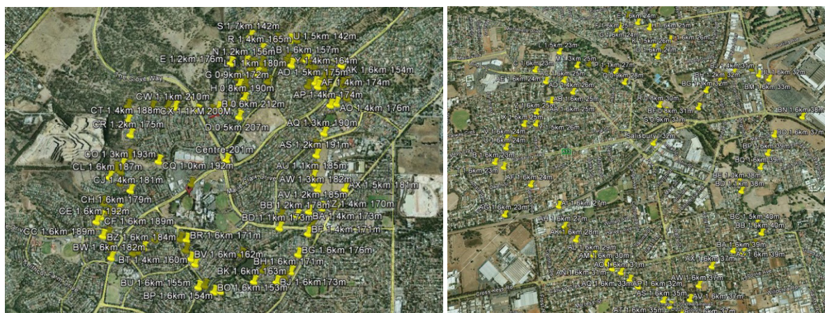
Figure 4: Maps of pedshed using Google Earth markers path distance function showing Golden Grove on the left and Salisbury on the right.