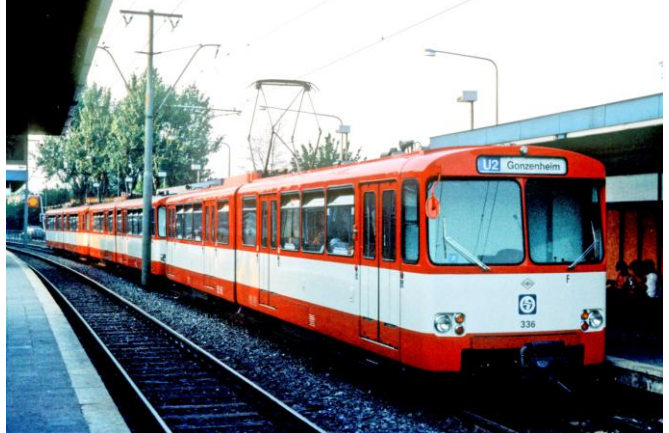
Figure 1: DüWag U2 car, surface alignment, Frankfurt

occurred earlier in the city's history, was to use transit for commuter traffic to clear the streets and highways for trucking and business rather than as an end in itself, and associated plans to clear the streets of trams.