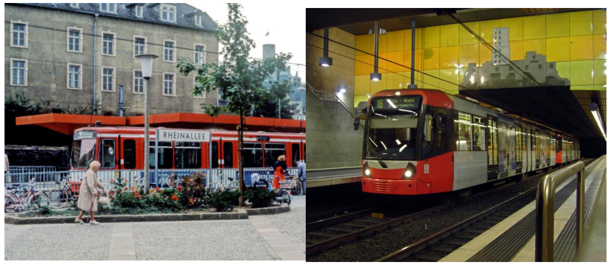
Figure 2: Past (surface) and present (underground) Bonn Bad Godesburg semi-metro stations

The city of Köln and its immediate neighbour Bonn provides the second case of the prototypical Light Rail system, and one that definitively illustrates the process of progressive upgrading. Bonn was the capital of West Germany at the time of the early Stadtbahn deployment and it was accordingly seen that it should have a full-scale U-Bahn system. This was created in concert with Köln by undergrounding the tramways in the central city areas. In 1962 Köln decided to build its Stadtbahn system, based on the existing tram network. This led to 42km of new Light Rail, 90km of exclusive tram right of way and only 30km of on-street track. Köln and Bonn now have linked extensive U-Bahn systems developed in this manner, although in Köln the process did not encompass the full extent of the urbanised areas. There was a major shift in policy in 1979; the city government chose to develop its system as a "Mischbetrieb" (mixed system) rather than a full U-Bahn configuration (Hall).