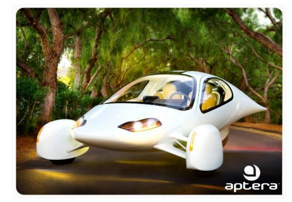
Figure 6: Three-wheel leaning vehicles