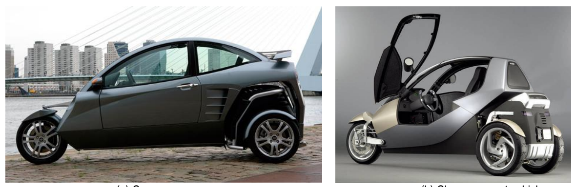
(a) Carver (b) Clever concept vehicle