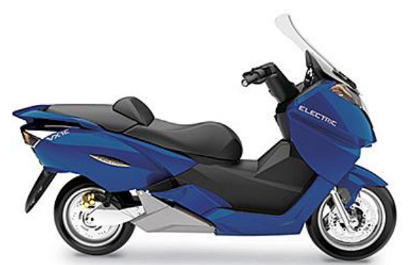
Figure 3: Vectrix Electric Scooter

The Vectrix electric scooter produces no on-road emissions (Figure 3). While still a prototype vehicle, the Sun Racer (Figure 4) represents a particularly interesting innovation in an electric motor scooter. The body is covered in solar panels. When the vehicle is parked a cowling is folded over the seat to increase the solar capture area and enable the vehicle to recharge its batteries.