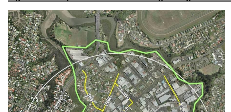
Figure 3 New Lynn Town Centre Parking Management 2013

There was support for the proposals to introduce mobility parking minimum standards and cash in lieu for mobility parking as well as to reserve two per cent of all parking spaces be reserved for motorcycles. Feedback regarding bicycle parking was equally divided with three in support of the proposals and three opposed to what they saw as "the provision of infrastructure for outdated technology