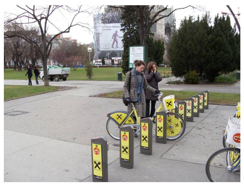
Figure 3 – Bicycle rental, Vienna

In transport terms, Vienna has placed itself in the top echelon of medium-sized world cities with a public transport-based system that seems at times to generate an inferiority complex from planners in Australian or US locations of a similar size. In future, Vienna's role on the world planning stage will hopefully be as a point of inspiration and a source of leading-edge planning and design ideas. The multi-tiered public transport network offers regional rail, suburban trains, a subway system, light rail and a relatively advanced bus network. These services seem to connect well with land use and significant activity locations. Access by walking and cycling is facilitated through well-designed infrastructure and conditions. When cycling is taken seriously, it can achieve significant mode shares. Vienna is aiming for an 8% share.