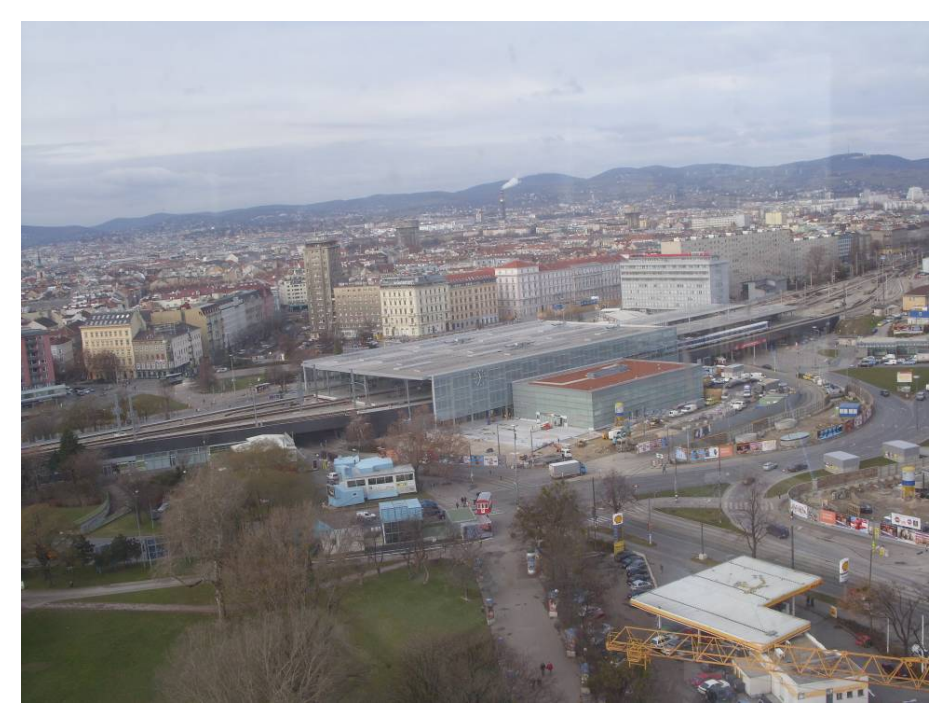
Figure 8 – Praterstern Station, Vienna: The Praterstern hub is an internationally-significant case study in the integration of multiple tiers of public transport – it offers regional, suburban and U-Bahn rail services, as well as light rail and bus.

Particular attention is given to new initiatives to integrate U-Bahn (subway or metro-style services) with "another mode" (presumably either bus or tram, but this concept is not elaborated in depth). This idea is noteworthy because of the tendency to think of metro-systems as stand-alone infrastructure, along with the design challenges of integrating above and below ground transit modes seamlessly.