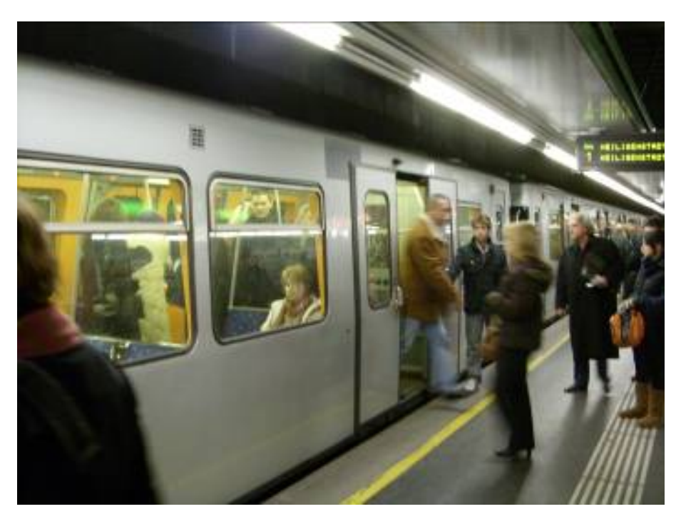
Figure 2 – Vienna U-Bahn Source: C Hale, September 2007.

The Viennese document addresses the issue of "awareness raising" – a process in which transport planners, policy-makers and politicians are recommended to actively engage in the ongoing promotion to the public of sustainable transport in preference to car-based transport. The Masterplan outlines a scenario in which maximum public acceptance of the need for and benefits of sustainable transport could lead to dramatic mode share outcomes. It is said that optimum travel behaviour patterns could eventuate in a situation where 86% of all trips in Vienna were taken by sustainable modes. The "awareness raising" effort aims to go as far as possible toward achieving this type of figure, through advertising, education and information-provision measures as well as encouraging policy makers and politicians to continue emphasising the importance of sustainable travel. This recommendation to political responsibility for sustainable transport is perhaps uniquely-European, and a contrast for New World transport planning documents which generally do not address this issue.