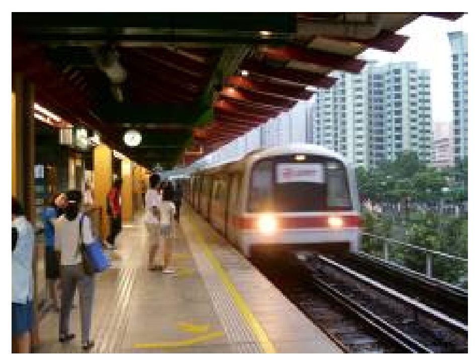
Figure 12 – MTR Station, Singapore: Brisbane increasingly needs to investigate best-practice examples in public transport infrastructure.