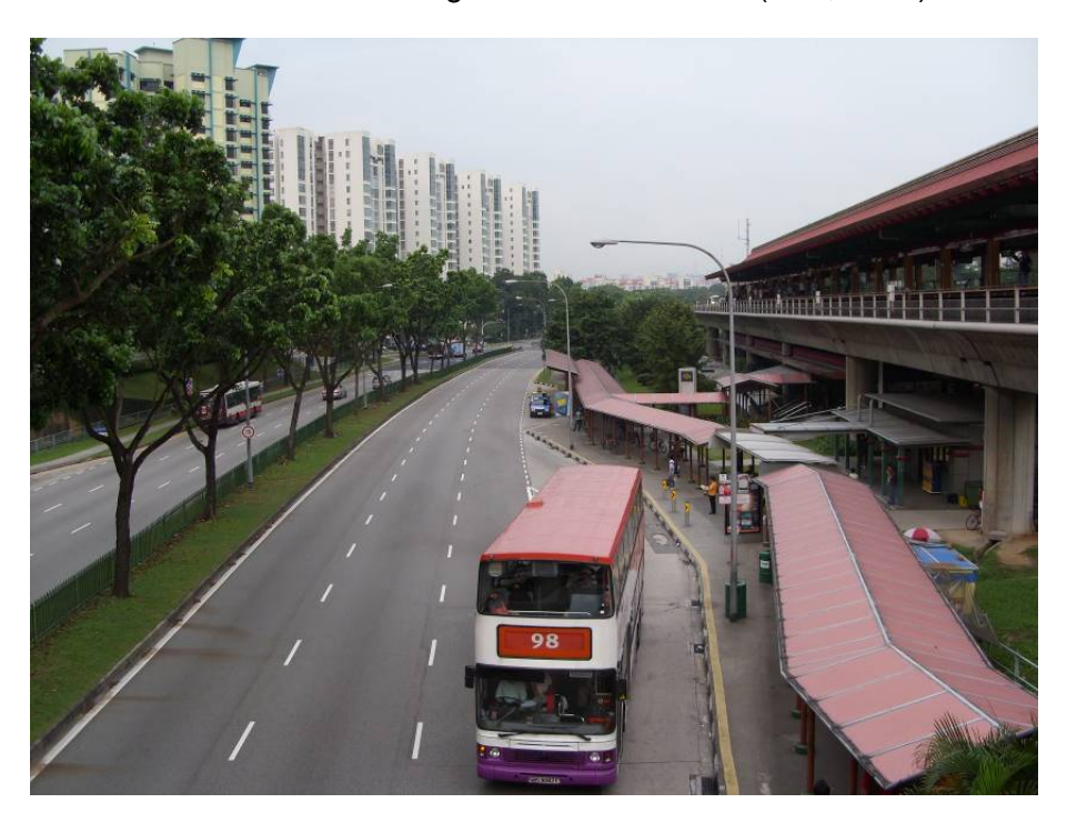
Figure 7 - Lakeside transport interchange, Singapore

The LTA document sets high targets for providing speedy door-to-door travel times to the average public transport user – this implies a close degree of integration between the modes, and short connection times delivered via high levels of service frequency. In addition, the fare structures and travel pass options for public transport ticketing are set to be revised in order to ameliorate transfer costs and encourage multi-modal travel (LTA, 2008).