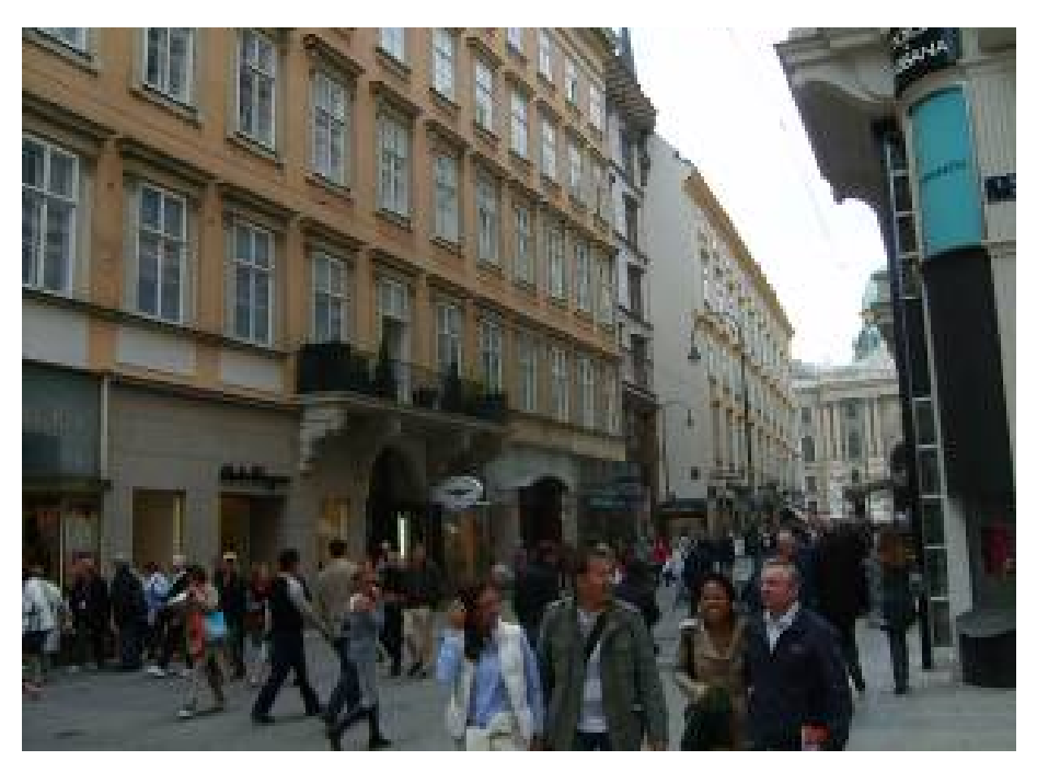
Figure 9 – Pedestrian area, central Vienna. C Hale, Sep 2007: Viennese planning emphasises the separation of activity areas from through-routes for cars.

"When undertaking the lines extensions and network expansions priority is given to those sections where there is adequate potential for further urban development or an essential contribution to improve traffic mode split can be made..." (Vienna, 2003:, 27)