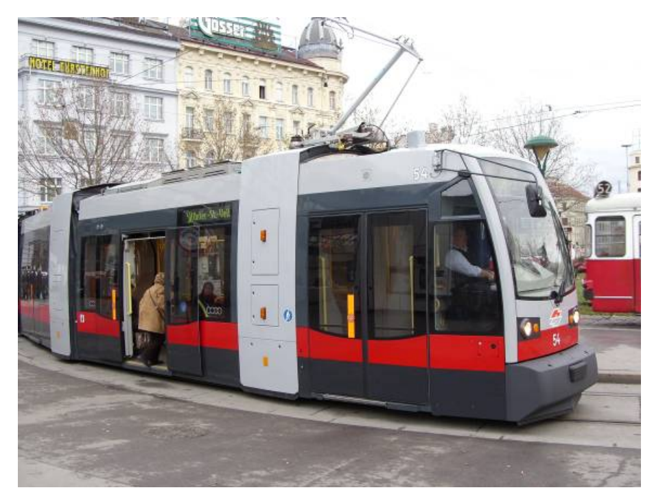
Figure 11 – Light rail, Vienna: Brisbane is yet to embrace a multi-tiered, fully-integrated vision for public transport.