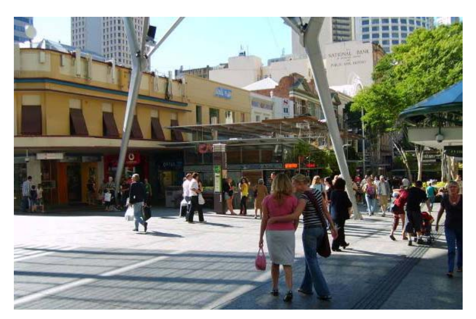
Figure 10 – Queen Street, Brisbane: Queen Street provides a successful example, but pedestrian zones beyond the CBD are hard to find.