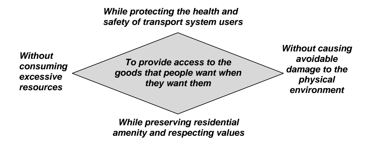
Figure 1 – The multi-faceted transport challenge