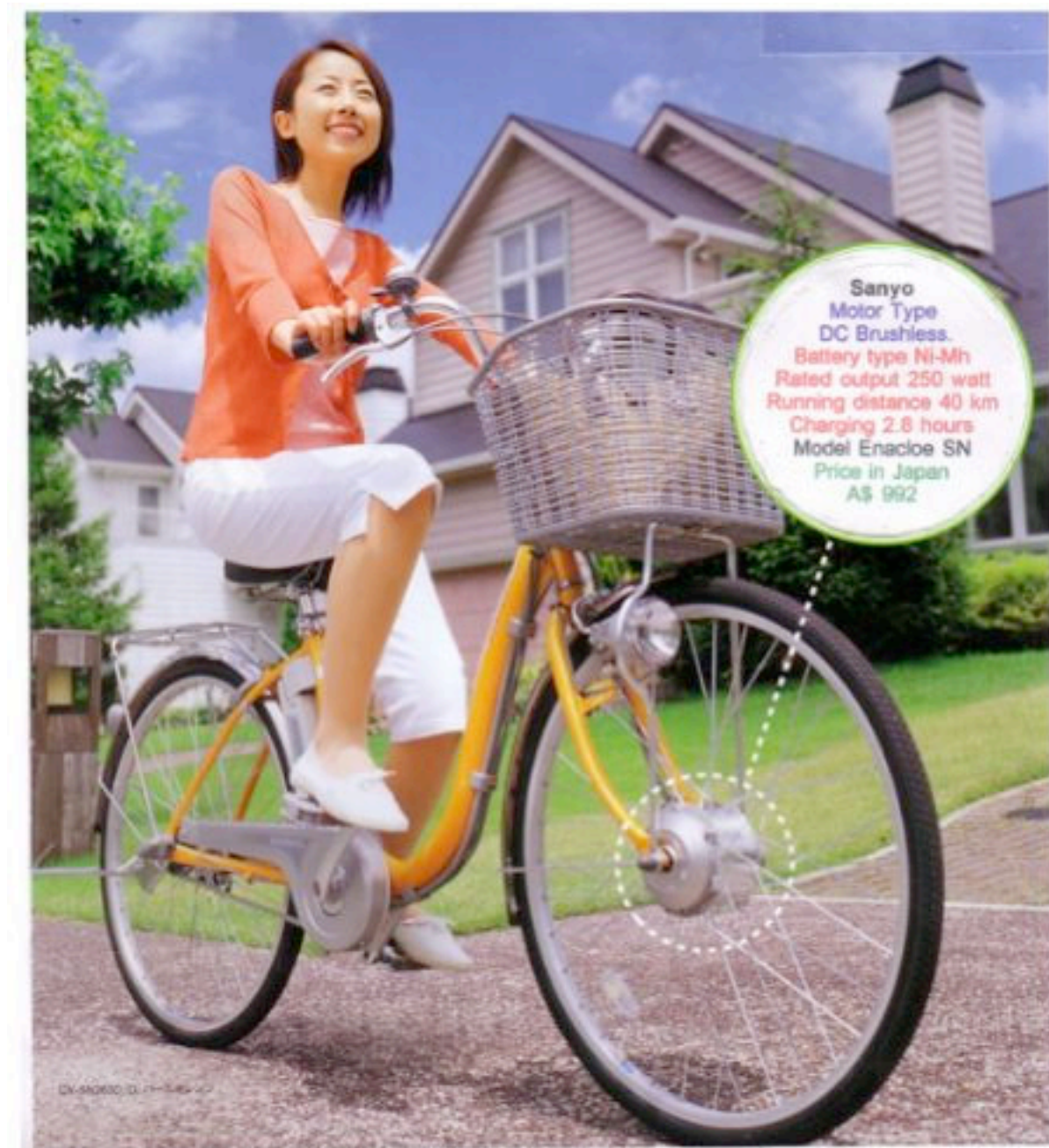
Figure 1 Sanyo electric PAB: 250 watt rated output Ni MH battery price today around a $1000. Note the small battery behind riders left foot.

They are designed to maintain a safe cruising speed and to halve the effort required to get from A to B on an average trip. They are powered on the flat by pedals but power assist cuts in when starting off, climbing hills, overcoming strong wind resistance or when carrying a heavy load. The crucial safety feature is automatic speed limitation which fades out from 20 to 25 km per hour. E PABs' silent operation and lack of emissions makes them very suitable for use on both shared footways and local residential streets, especially as residential streets have 30 kph limits in Japan. Since 1997 there has been a growing range of electric PABs on the world market with sophisticated electronic controls and there are around 130 companies producing them world wide. Some of these companies use Japanese made drive units and electronic control systems.