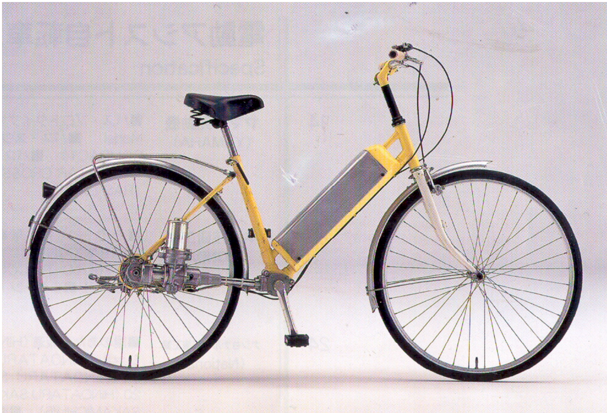
Figure 5 A major design breakthrough: the Yamaha PAS prototype

Consumer surveys by Yamaha in the 1980s showed that most PAB users were women or elderly males. From an ergonomic viewpoint the lower power to weight ratio of these groups was taken into account in formulating the 50% power assist concept for the second generation PAB which was released in 1989: the 'PAS Prototype' with a maximum power output of 235 watts. The Yamaha 'PAS Prototype' was a major design breakthrough with torque sensors in the cranks which are linked to the motor controls for automatic power assistance. The basic design concept was that only half the normal pedaling effort would be necessary for most trips.