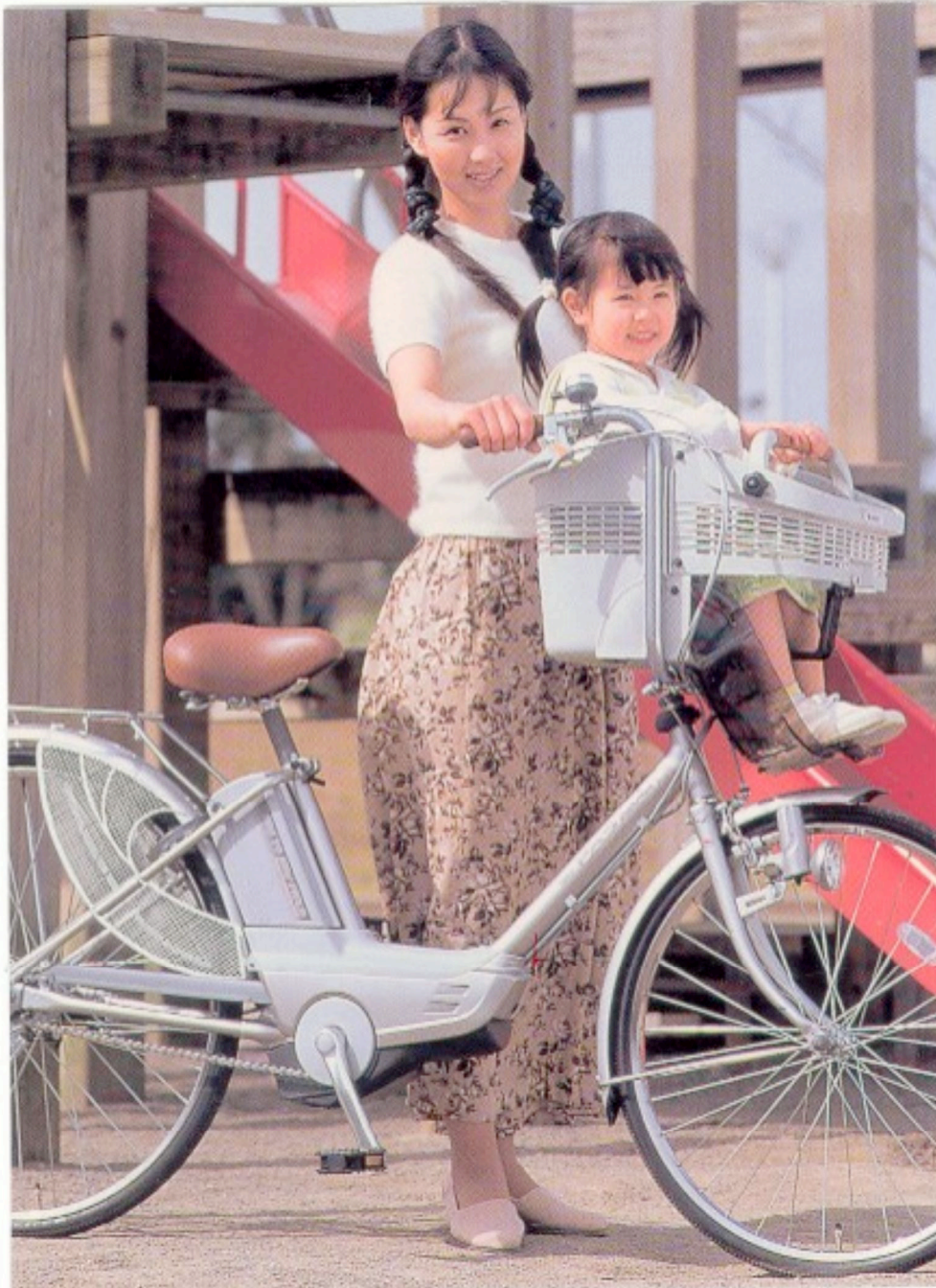
Figure 6 The PAS Little More has (1) A stable child seat (2) Ease of control and operation with a new keyless switch design and battery remaining indicator (3) Dynamo lighting control

In 1995, after six years of development, the Yamaha PAB was sold nation wide. From that time many companies in both Europe and Japan became involved in E-PAB design and production; many built their own bicycle frames around Yamaha's 'PAS power unit'.