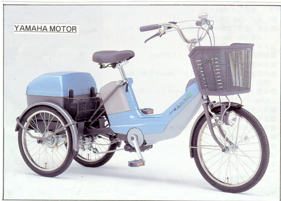
Figure 7 This Yamaha electric shopping tricycle has excellent stability and load carrying power. Battery charging takes 2.8 hours and it will carry the rider 35 km on flat roads. Electronic indicators show battery levels and a dynamo light is fitted that stays bright at low speeds. It comes complete with a built in front wheel lock, comfortable sprung saddle and front basket. This model weighing 36 kg is no longer available but the Bridgestone shopping tricycle that weighs 8 kg less is now available.