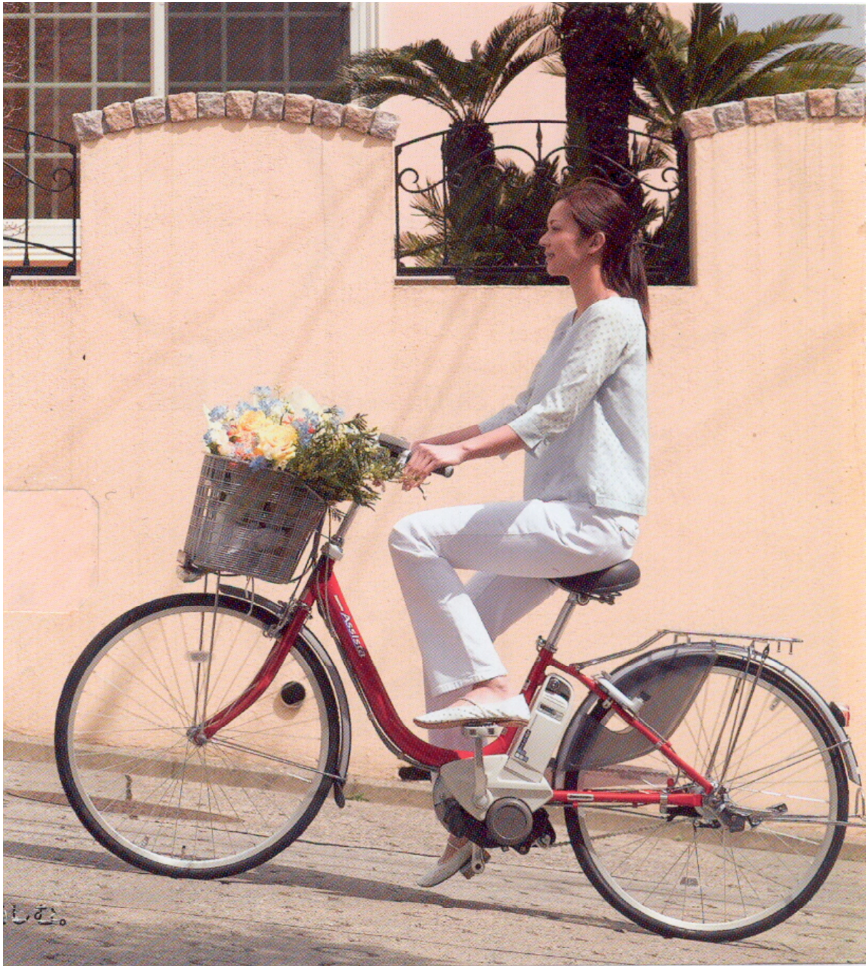
Figure 7 2006 model of a Japanese electric PAB that cannot be purchased in Australia due to obsolete legislation

Feedback from the Australian bicycle industry suggests that the Australian electric PABs market is not like either the Japanese or Chinese domestic market. The Australian market is likely to be dominated by males aged over 50 years. It is likely that these older riders will represent a growing market particularly as mobility issues for older drivers are magnified with