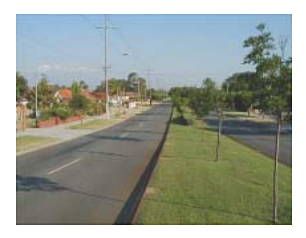
Figure Six: Four lane Divided Distributor with driveway access.