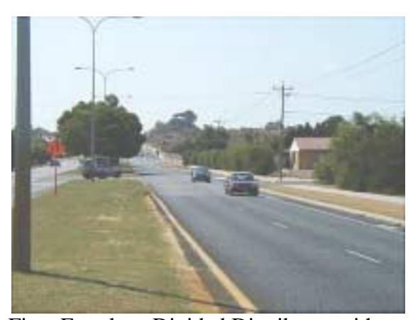
Figure Five: Four lane Divided Distributor without driveway access

In the conventional approach pedestrians are segregated from vehicles, usually along pathways which are distant from activity and not overlooked. This replaces road safety dangers with creates personal safety dangers. It can then reduce the numbers who choose this mode – even for very short journeys. The issues are illustrated in Figures Five through Twelve.