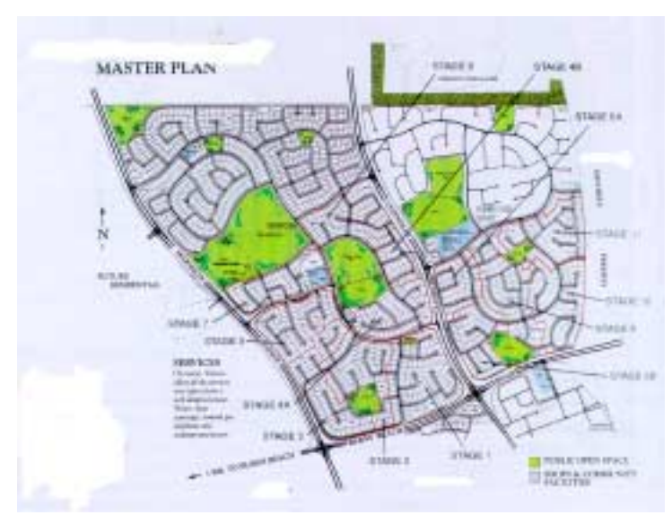
Figure One: The conventional approach to street layout.