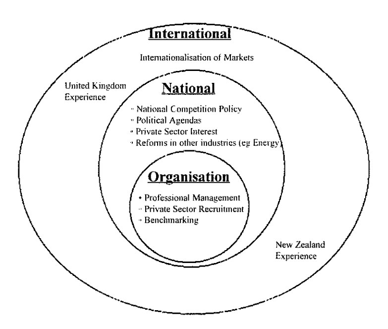
Figure 1: Driving Forces

Within a national context, Australia has adopted National Competition Policy ("the Hilmer Report"), which is now driving the agenda at Government levels to achieve cost efficiency and other benefits through the freeing up of markets to competition. National Competition Policy is more likely to be cited as the excuse for industry reform rather than a reason for change. It is often quoted but rarely understood. The Hilmer Report defined what it meant by competition policy, as follows: